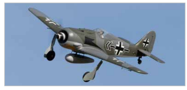
New FW-190A fitted with the Payload Release Unit & optional retracts.