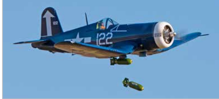
Payload Release Unit clearly shown mounted to the new Hangar 9 60cc Corsair.